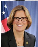
Kathryn Sullivan , Acting Under Secretary of Commerce for Oceans and Atmosphere and Acting NOAA Administrator